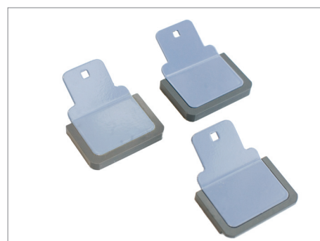
A Cover Guide and two Cover Positioning Holders are included.