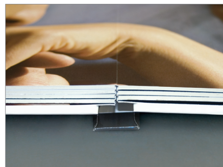
The finished book opens astonishing 180 degrees.