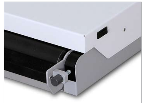
The integrated edge folding unit is adjustable for different cover board thicknesses.