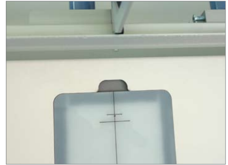
Registration marks for thicker and thinner materials offer you more versatility in applications.