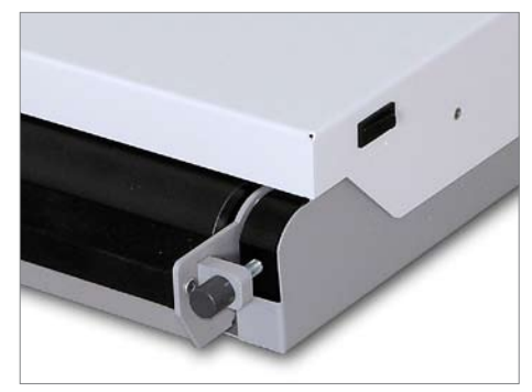
The integrated edge folding unit is adjustable for different cover board thicknesses.